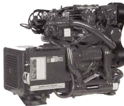
4.5 BCGTC Gasoline Generator